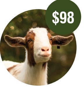
A GOAT in Haiti

Buying healthy food is hard when you're new to an area and have a limited income. Help a refugee settle into their new situation and show them that someone cares about their daily wellbeing by supporting them with a week's worth of groceries.