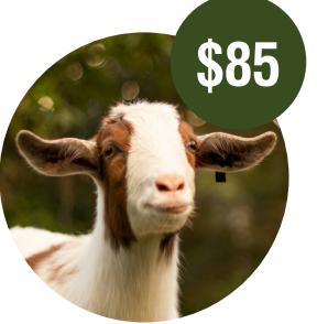
A GOAT in Haiti

Buying healthy food is hard when you're new to an area and have a limited income. Help a refugee settle into their new situation and show them that someone cares about their daily wellbeing by supporting them with a week's worth of groceries.